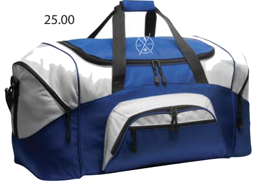
25.00 BG99 Port Authority® - Sport Duffel