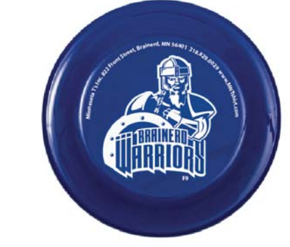
8.00 Fisbee 9" flyer 8.00