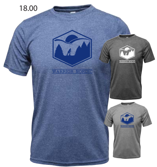
XT76H Men's Xtreme-Tek T-Shirt