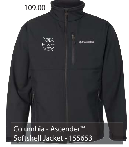
109.00 Columbia - Ascender™ Softshell Jacket - 155653