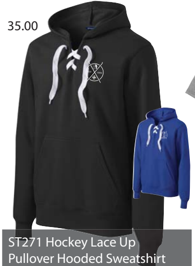
35.00 ST271 Hockey Lace Up Pullover Hooded Sweatshirt