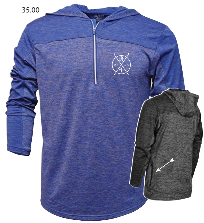
DT724 Adult Dry-Tek Vintage Hoodie 7oz W Back Zipper Pocket

Group orderform brought to you by: Minnesota T's Inc - 822 Front Street, Brainerd, MN 56401 218.829.0029 Fax 218.829.8107