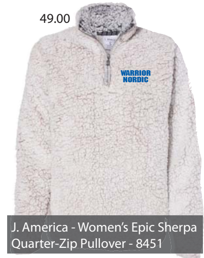
49.00 J. America - Women's Epic Sherpa Quarter-Zip Pullover - 8451