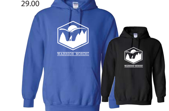
29.00 Gildan - Heavy Blend™ Hooded Sweatshirt - 18500