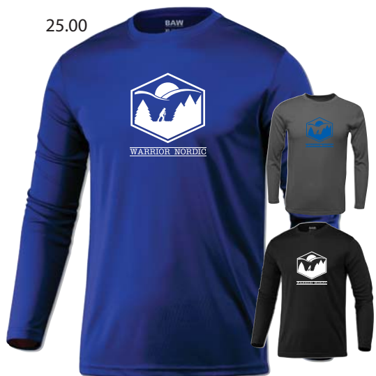
XT96 Men's Xtreme-Tek Long Sleeve Shirt