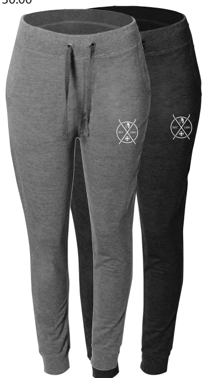
FT61 Ladies French Terry Jogger