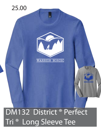
25.00 DM132 District® Perfect Tri® Long Sleeve Tee