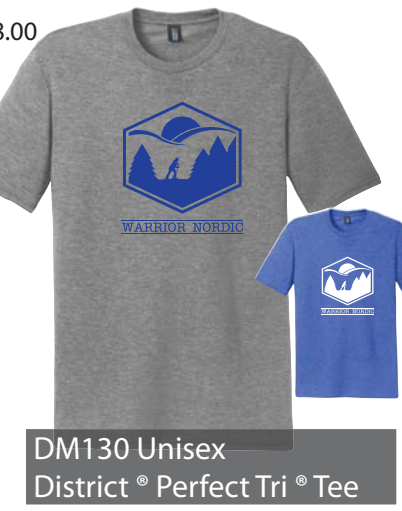
18.00 DM130 Unisex District® Perfect Tri® Tee