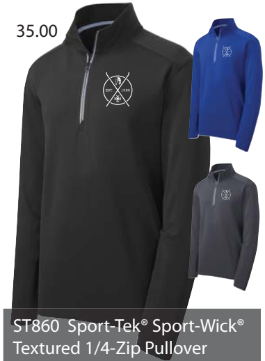
35.00 ST860 Sport-Tek® Sport-Wick® Textured 1/4-Zip Pullover