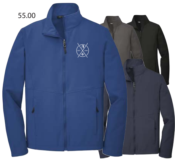
J901 & L901 Port Authority Softshell Jacket