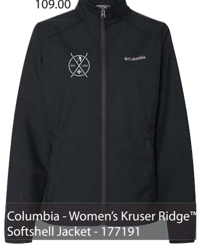
109.00 Columbia - Women's Kruser Ridge™ Softshell Jacket - 177191