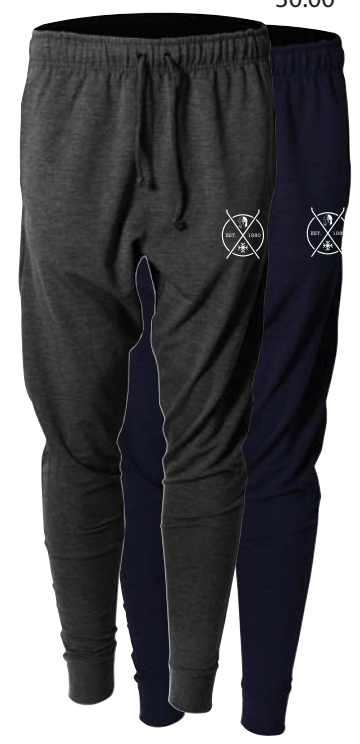
F64 Adult Tri-Blend Jogger