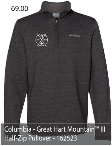
69.00 Columbia - Great Hart Mountain™ III Half-Zip Pullover - 162523