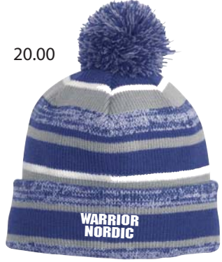
20.00 NE902 New Era® Sideline Beanie