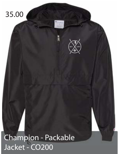
35.00 Champion - Packable Jacket - CO200